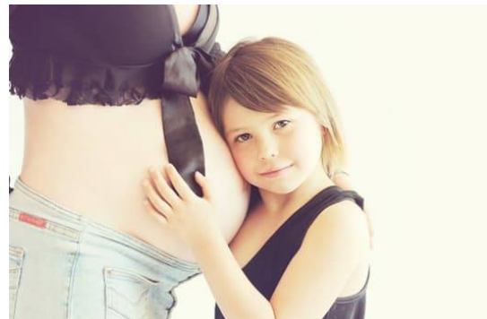
Pregnant and getting a flu shot